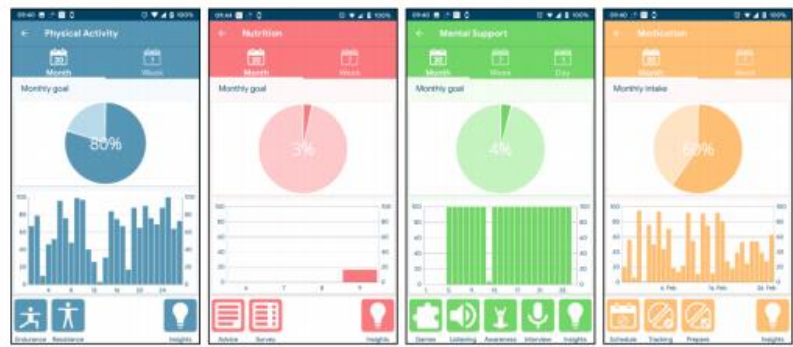
Dashboards of the mobile app for physical activity, nutrition, mental support, and medication management.